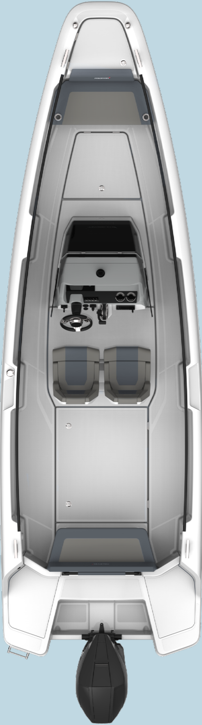
Axopar 22 Spyder Standard aft sofa configuration with optional front deck seat incl. cushions with harbour cover