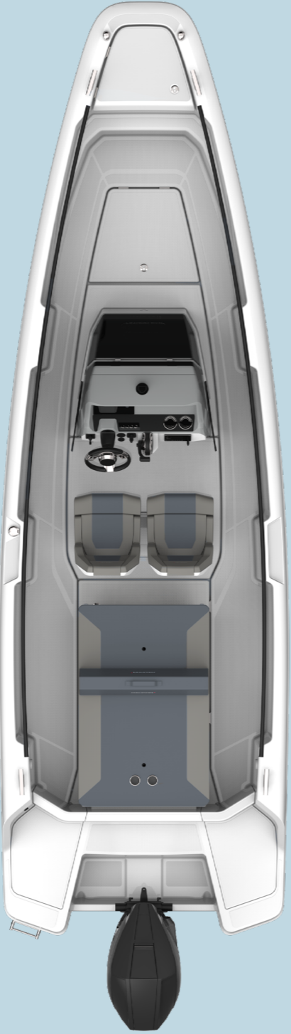
Axopar 22 Spyder Multi-storage configuration with optional Multi-storage cushions with harbour cover