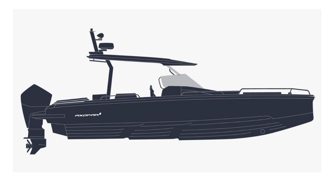
Image caption: The all new Axopar 29 XC (Cross Cabin) and ST (Sun Top)

Pictures can be downloaded via the link HERE .