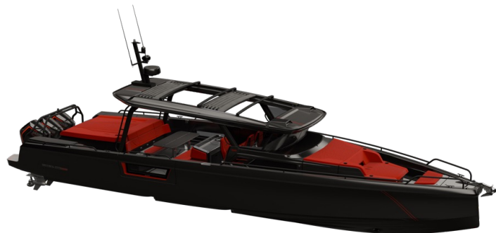
BRABUS Shadow 1200