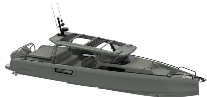
BRABUS Shadow 1500